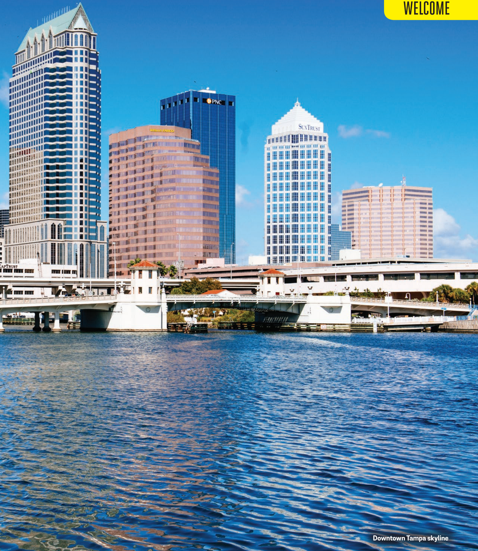
Downtown Tampa skyline