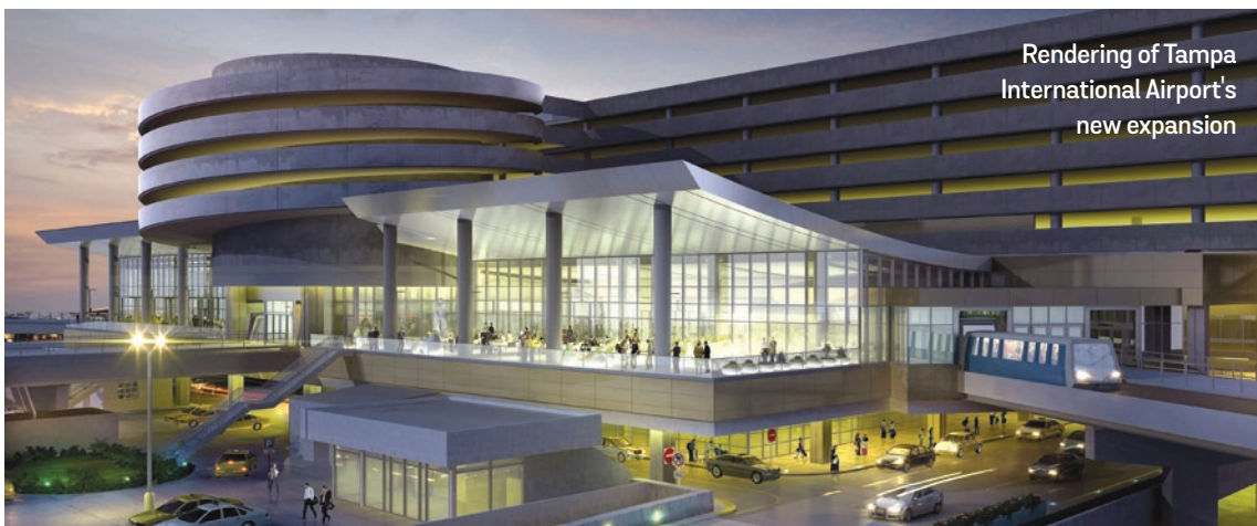
Rendering of Tampa International Airport's new expansion

The new COE aligns with GE Energy Management's continued commitment to advanced manufacturing, which focuses on building leading edge technology, using better and faster methods. It encompasses new digital fabrication technology, lean methods and rapid-prototyping, advanced materials sciences, supply chain efficiency and open innovation.